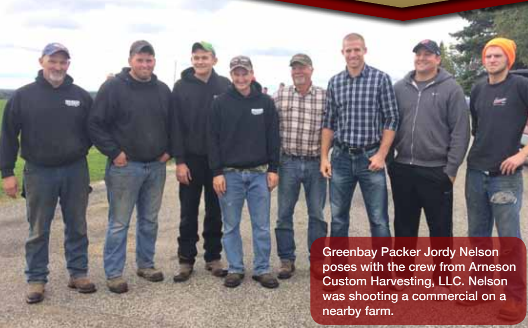
Greenbay Packer Jordy Nelson poses with the crew from Arneson Custom Harvesting, LLC. Nelson was shooting a commercial on a nearby farm.

Representing Custom Farming in Wisconsin | FALL 2016