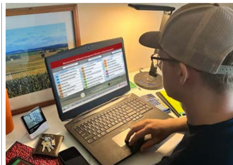
The NMFE curriculum is delivered in an online, module-based format that allows for self-paced learning. Users still have access to the same experts and resources, but now can use the curriculum when it is convenient for them.

Next, the weight of the tractor and full manure spreader needs to be recorded. This can be done using portable axle scales or a large machinery scale, such as the scales commonly located at grain elevators and cooperatives.