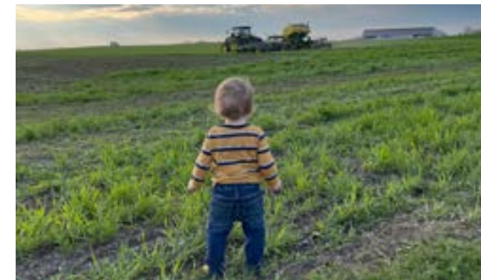
Dvorachek Farm & Industry, Brillion Wis.

Please e-mail your high-resolution images (1MB or larger) to execdir@wiscustomoperators.org and we will be sure to feature you on our social media channels and in our publications. Thank you in advance!